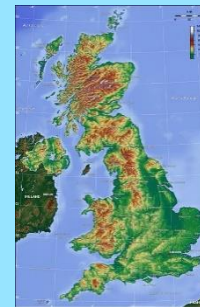
Relief map of the UK