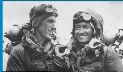
Edmund Hillary and Tenzing Norgay 1953