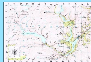
Ordnance Survey map of the Elan Valley reservoirs