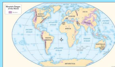
Mountain ranges of the world