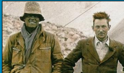
Andrew Irvine and George Mallory 1924